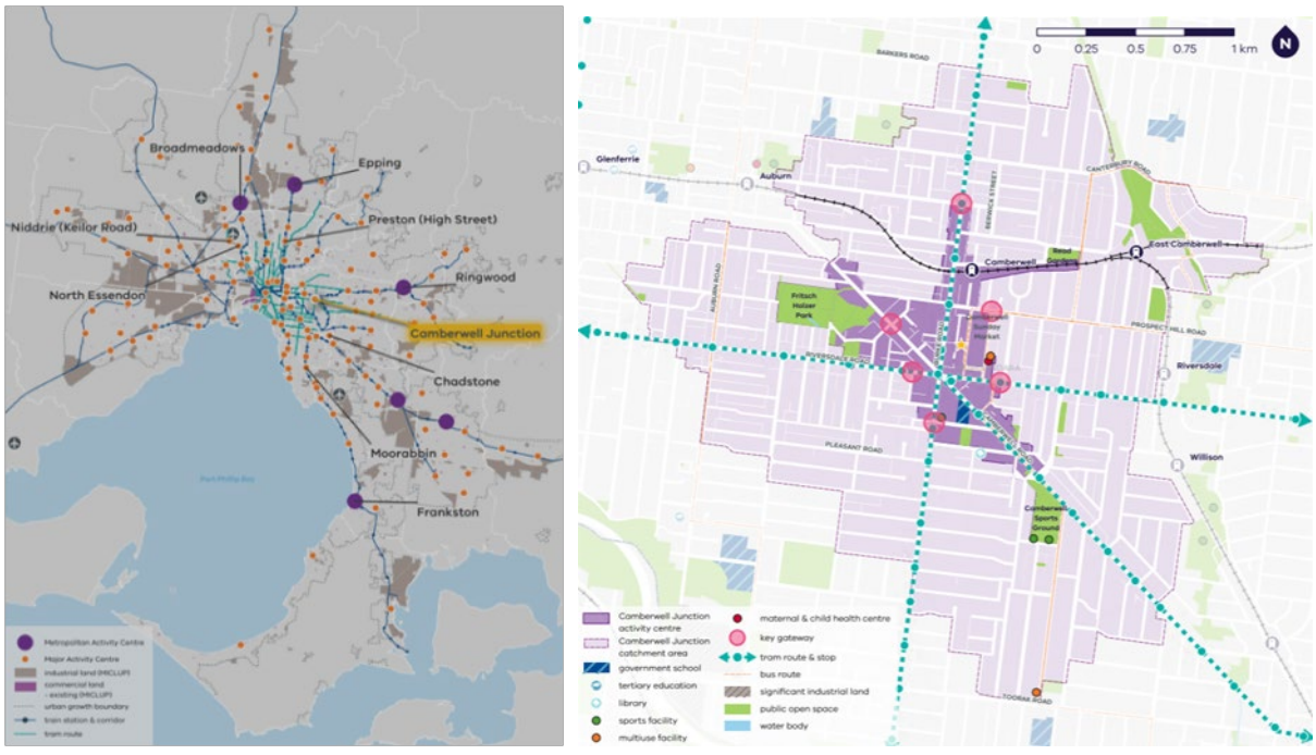
Source: Draft Camberwell Junction Activity Centre Plan, Plan 1 (left) and Figure 1 (right)

The draft Camberwell Junction Activity Centre Plan (Activity Centre Plan) sets out proposed built form parameters for the Activity Centre and the catchment that are guided by the recently