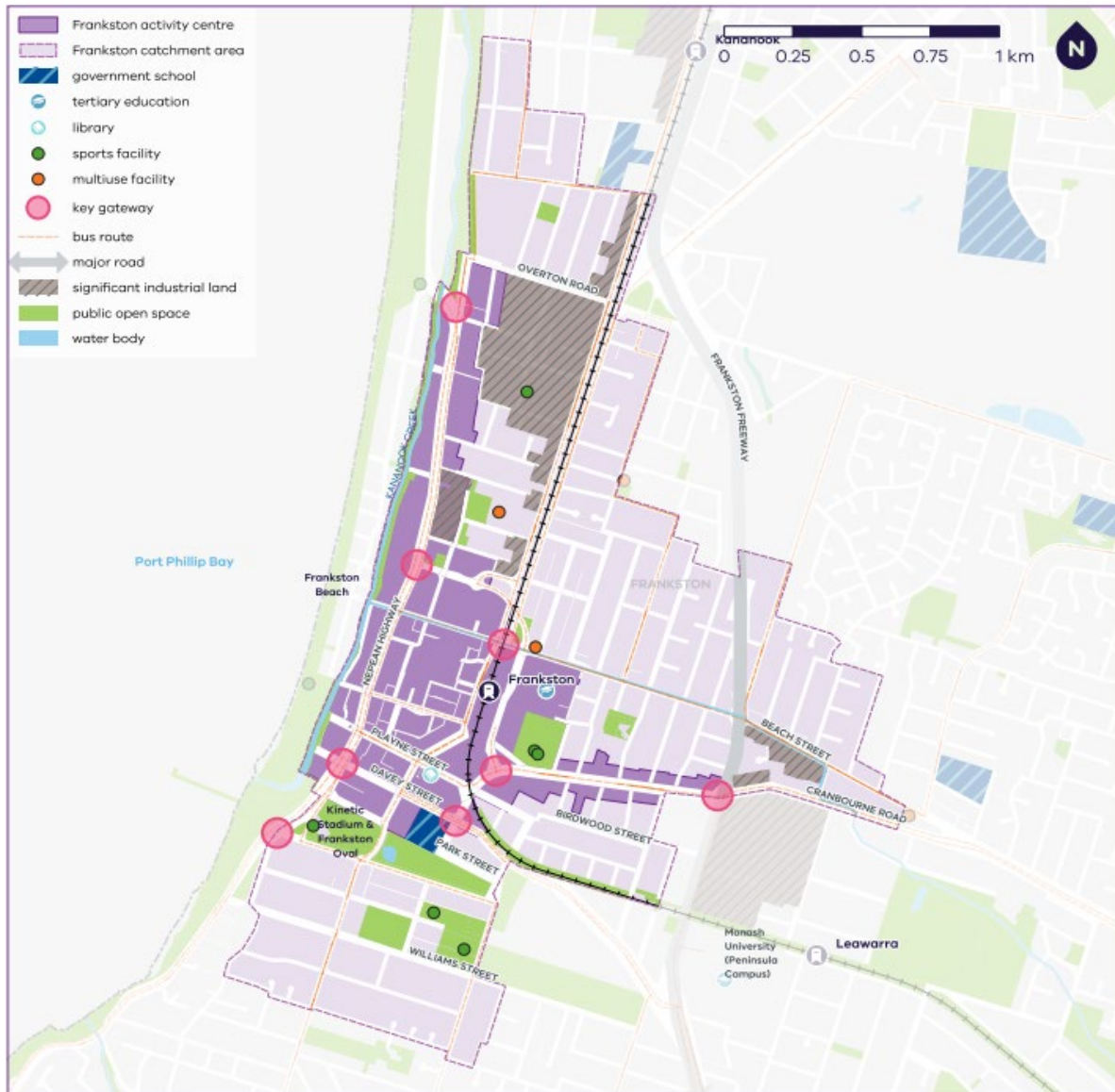
Figure 2 Activity Centre catchment