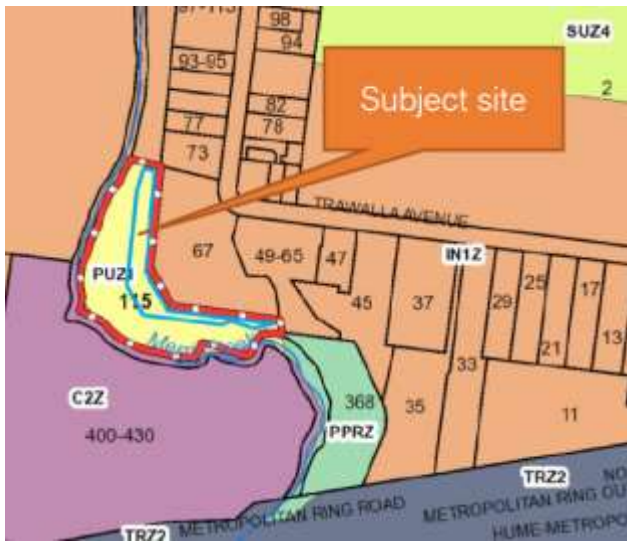
Figure 3: Current zoning