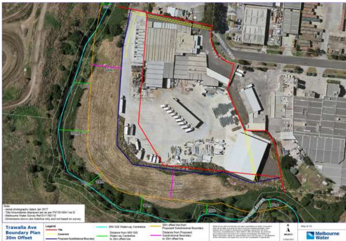
Figure 5: 30 metre offset diagram

The Committee requested that Melbourne Water provide a marked-up plan depicting a 30 metre line relative to the site boundary (see Figure 5).