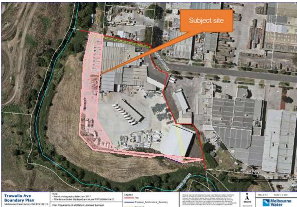
Figure 1: Subject site

The subject site has an area of 0.419 hectares and owned by Melbourne Water. It is used and developed for industrial purposes by Bertocchi as part of its manufacturing operations. The hardstand including car parking and building that occupy the subject site were authorised retrospectively by planning permits issued in 2016 and 2017.